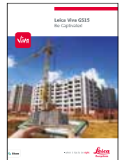
Leica Viva GS15